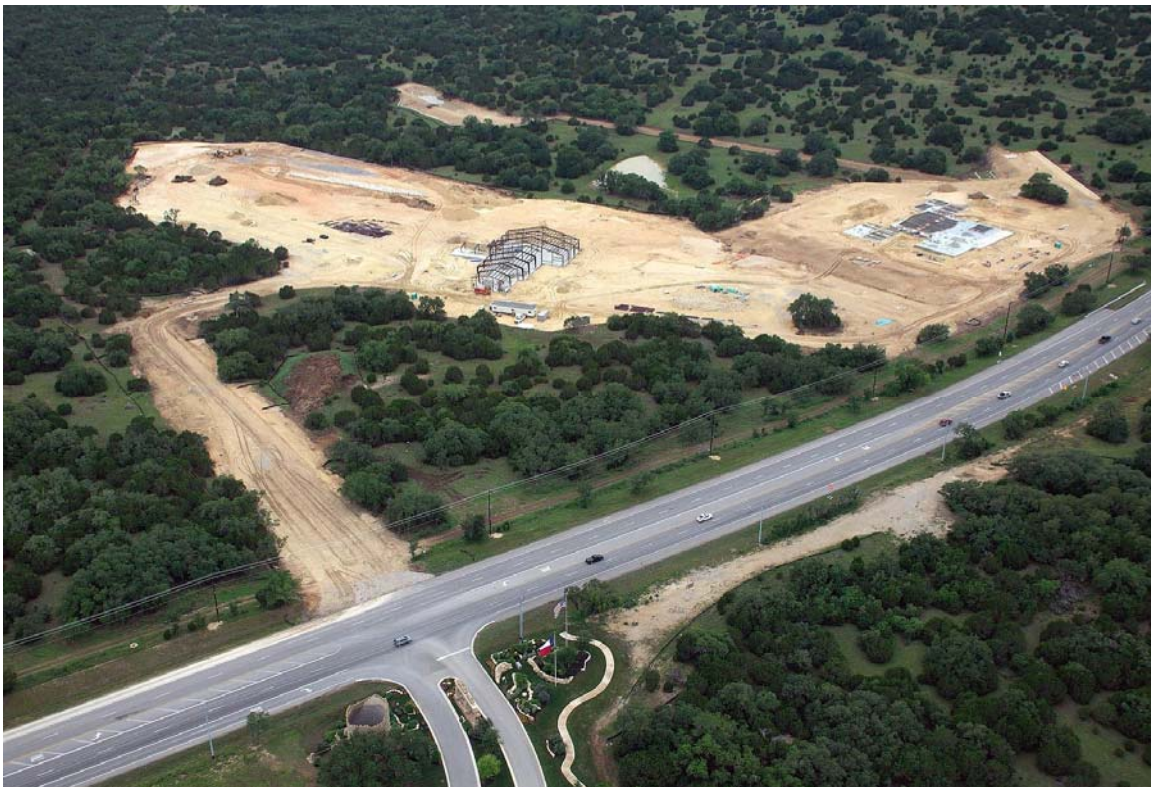
Transportation Center / Distribution Center site photo taken 6/3/10